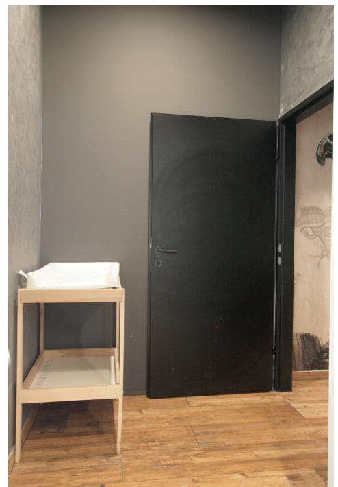
Entrance area accessible toilet