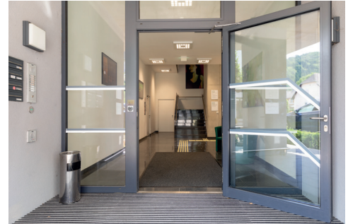
Entrance to new building