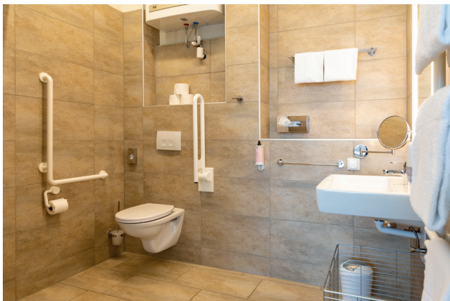
Bathroom in room 202