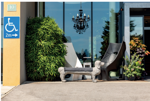
Parking space in front of main entrance