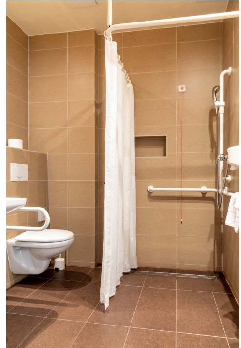
Bathroom in room 51