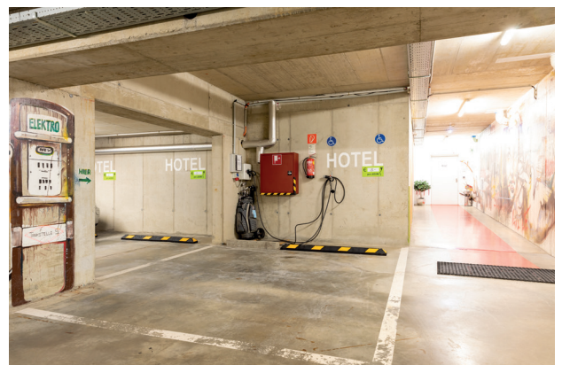
Parking space in underground car park