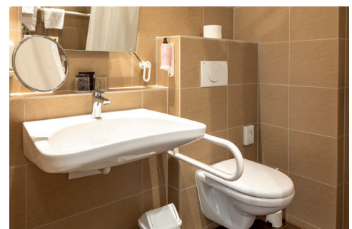
Bathroom in room 51