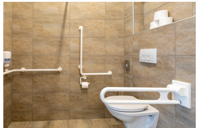
Bathroom in room 202