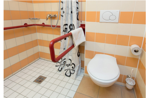
WC in bathroom