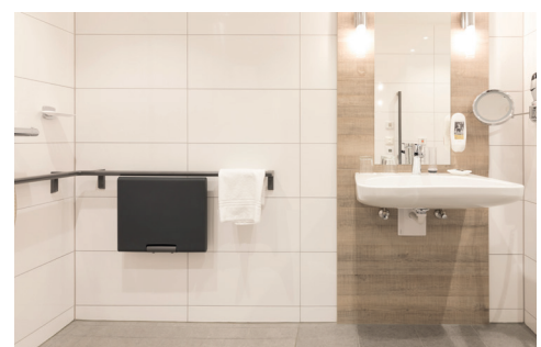
Bathroom Barrier-free room no. 417