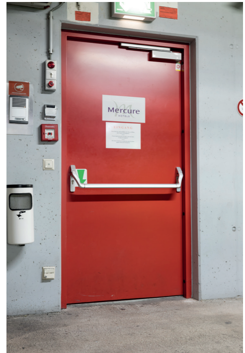
Hotel access from the underground parking garage