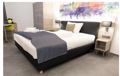
Barrier-free room no. 417