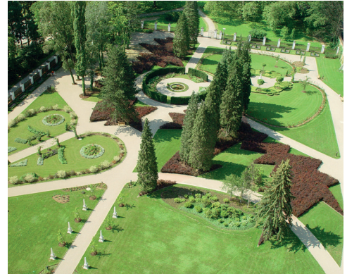
Planetary Garden at the Archaeology Museum