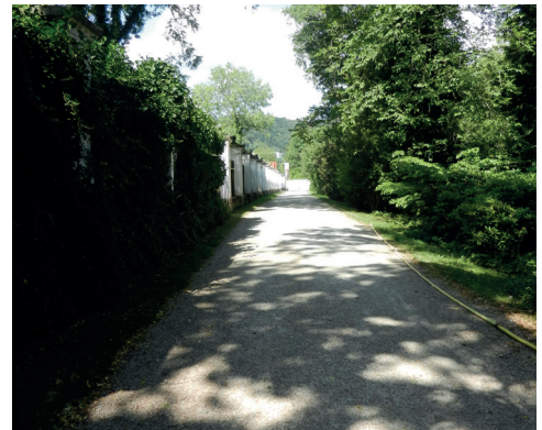
Path to the Museum