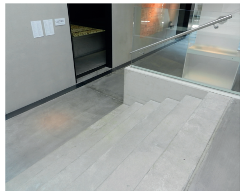
Stairs inside the museum