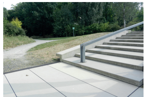
Barrier-free path and steps to the entrance