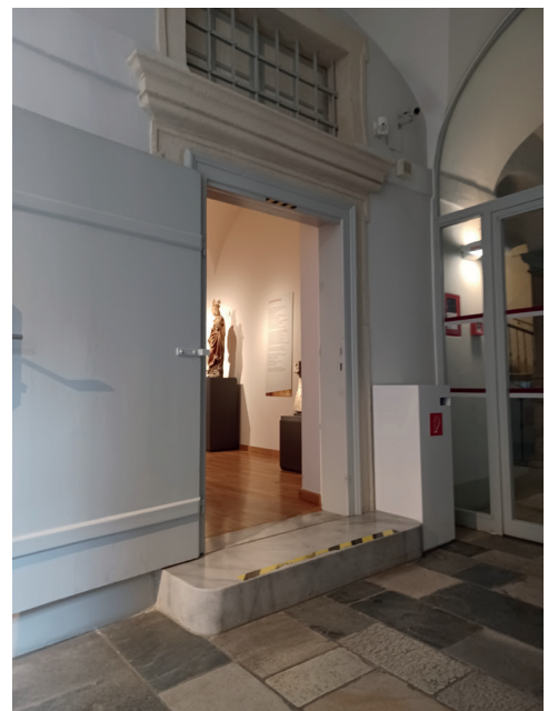
Access to permanent exhibition with step

There is sufficient space in the exhibitions themselves.