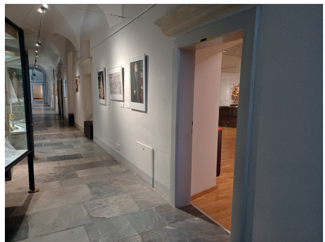
Access to special exhibition