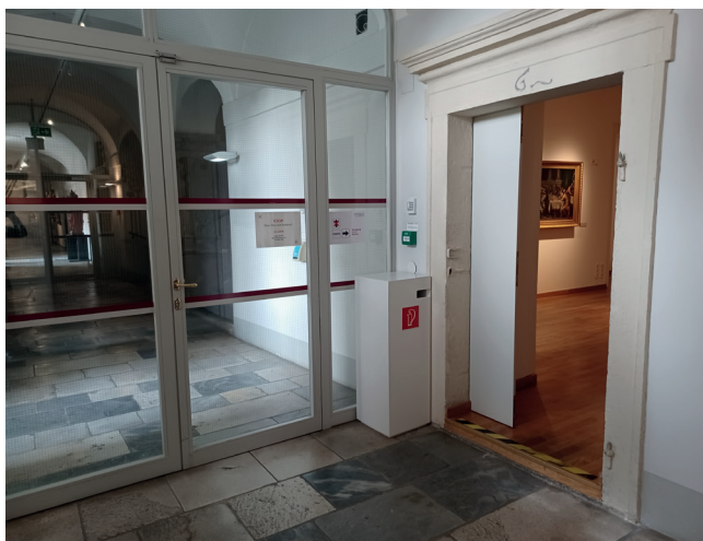
Access to permanent exhibition with 9 cm threshold