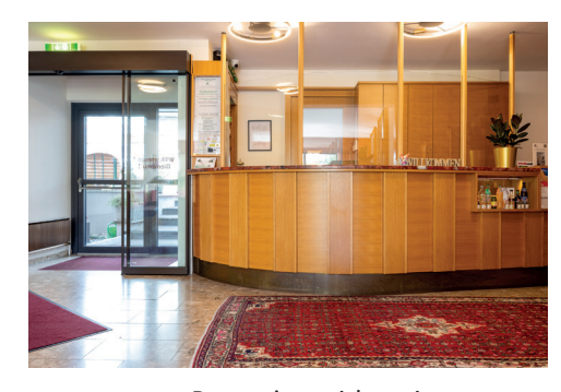
Reception with main entrance

Messeplatz 1/Messeturm 8010 Graz | Austria T+43 316 8075 0 www.graztourismus.at