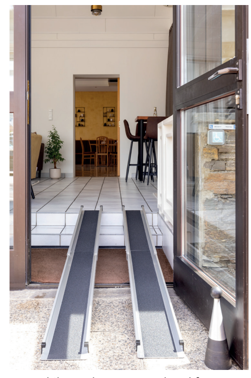
mobile outdoor ramp to breakfast room