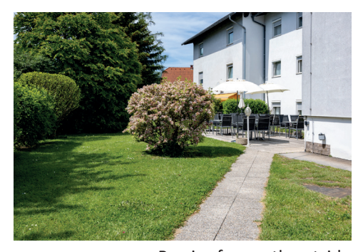
Barrier-free path outside around the house to lift