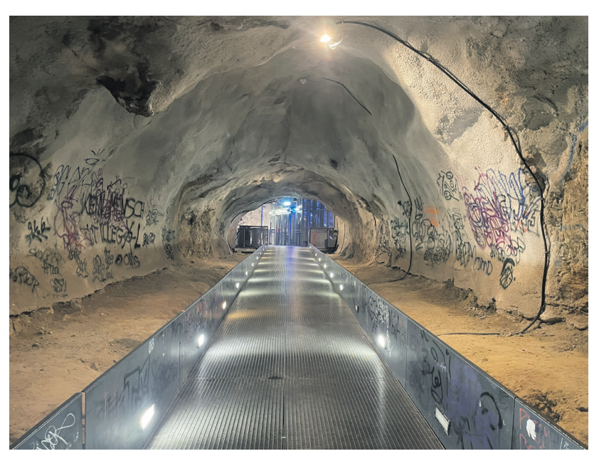
Ramp from lift to Dom im Berg