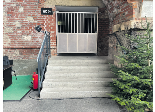
Access non barrier-free WC