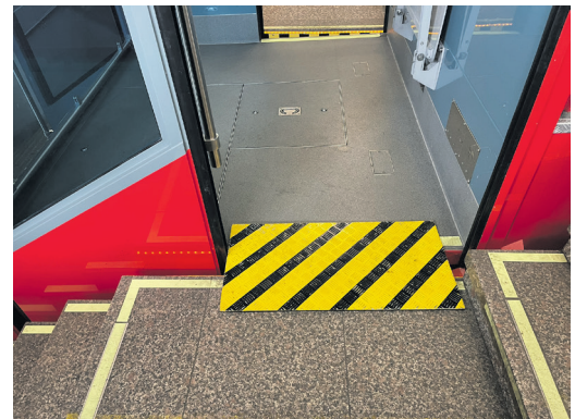
Mobile bridging between funicular and platform