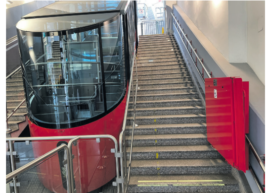
Schlossberg funicular with stair lift