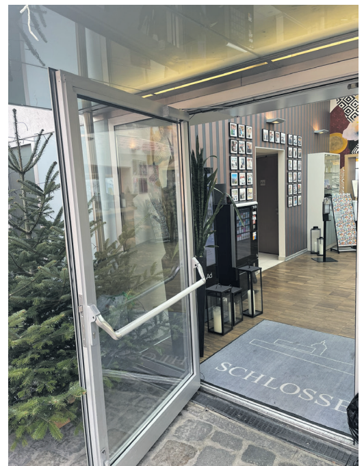
Access Schlossberg Restaurant