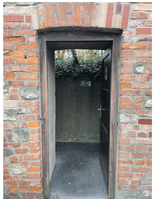
Door to balcony boxes on the right