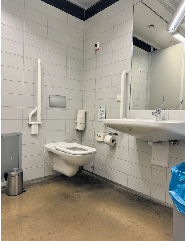
Barrier-free ladies' WC