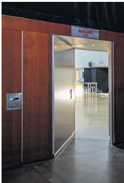
Access to event hall