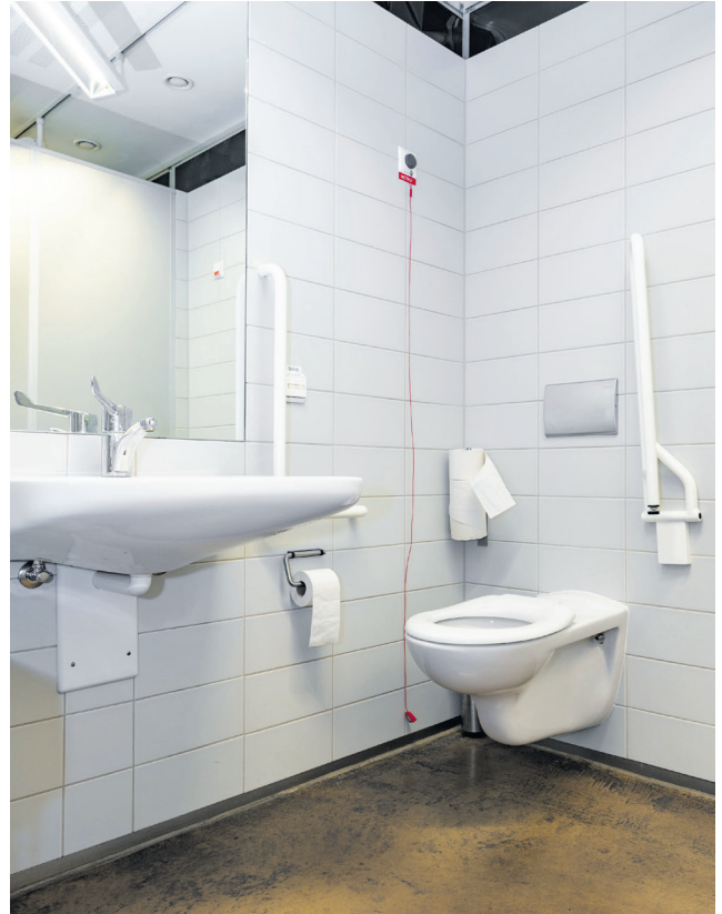
Barrier-free men's WC (without description)