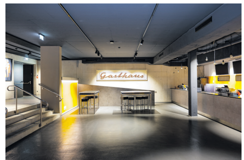
Bar and ramp Detroit Hall