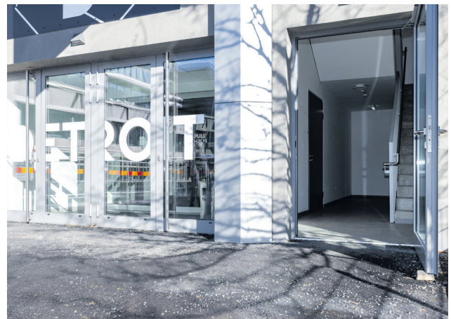
Main entrance and barrier-free entrance Detroit Hall