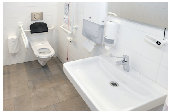
Barrier-free WC Detroit-Hall