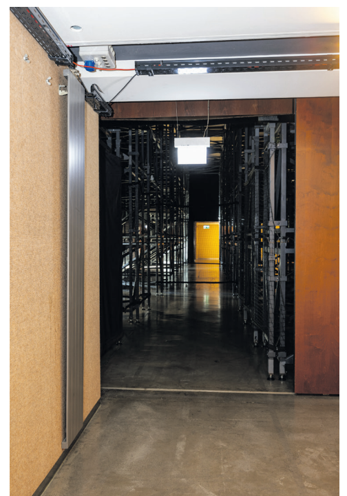
Path to the front seats