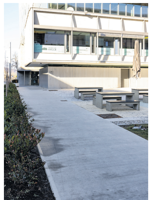
Barrier-free access from parking