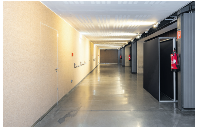
Path to the front seats