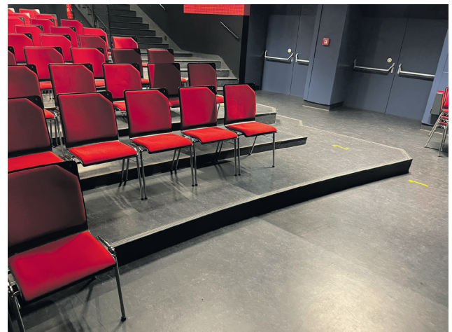
Auditorium, wheelchair spaces