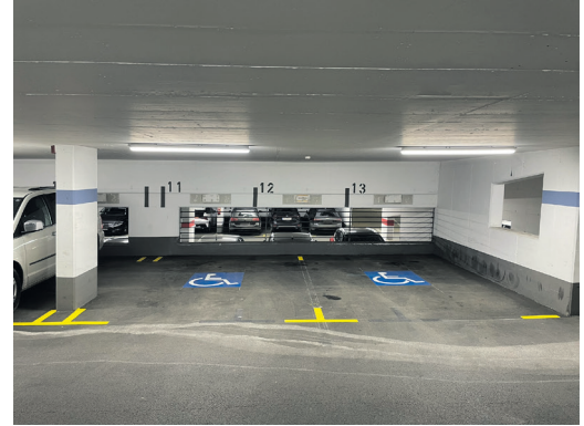
Car parking Operngarage