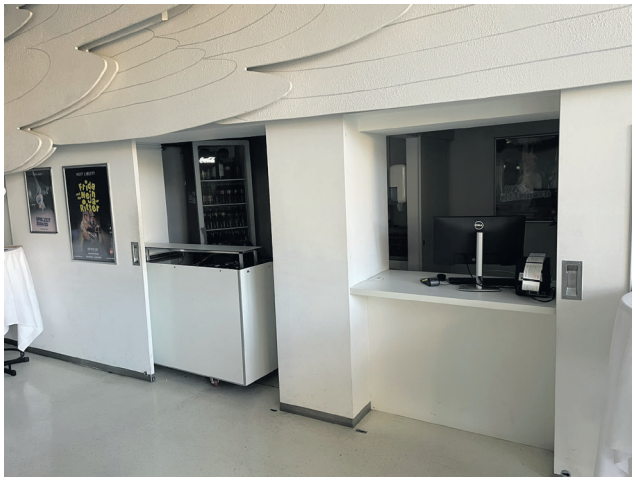
Bar (left) and cashdesk (right)