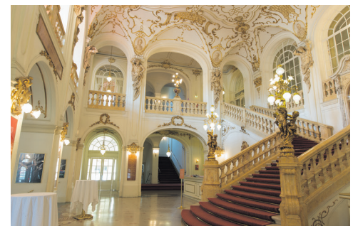
Foyer and main staircase