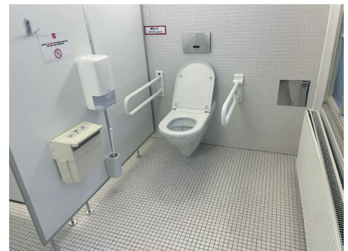
Ladies' WC ground floor