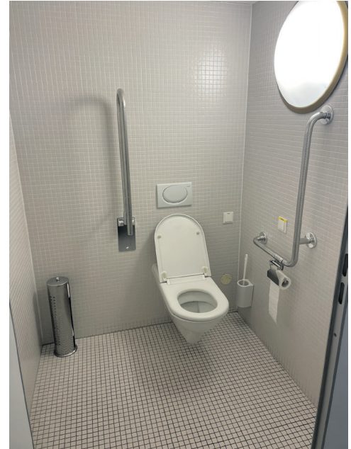
Gents' WC ground floor