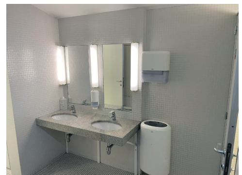
Gents' WC ground floor