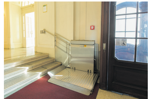
Steps and stair lift