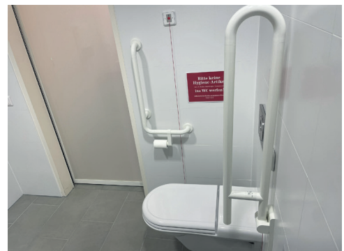
Barrier-free WC Studiobühne