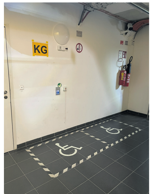
Emergency spaces for wheelchair users