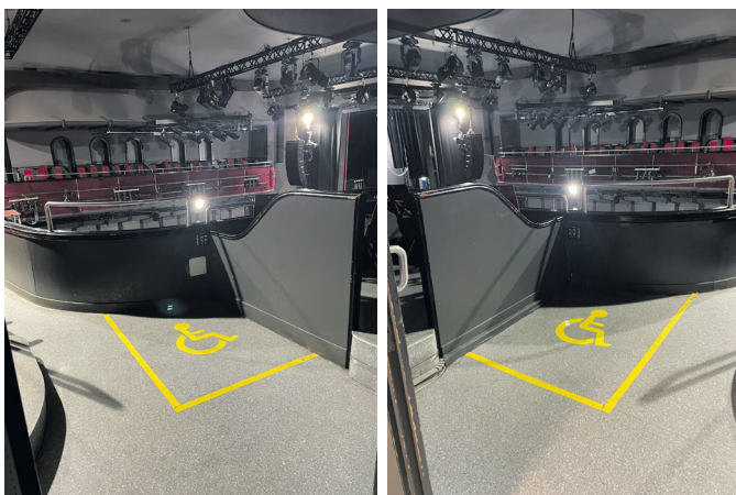
Wheelchair spaces balcony