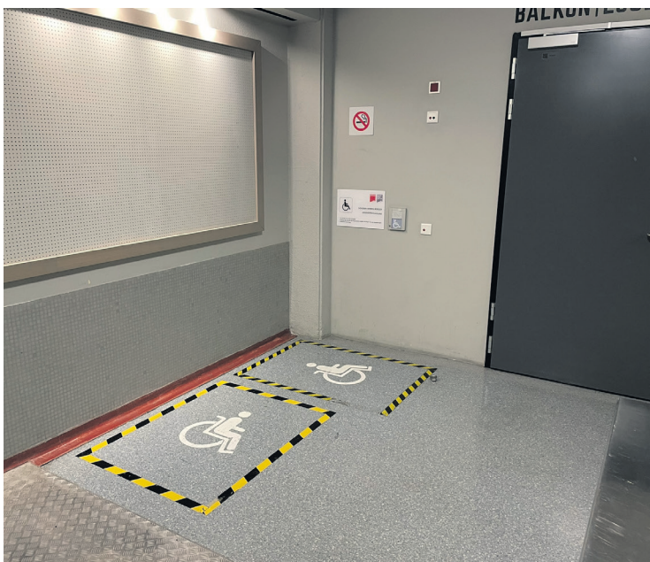
Spaces for wheelchair users in emergency cases (1 st floor)