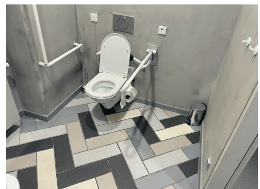
Barrier-free WC ground floor