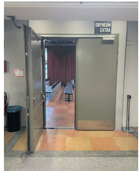
Orpheum Extra - Entrance