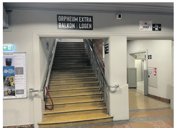
Stairs and access to barrier-free WC on the ground floor