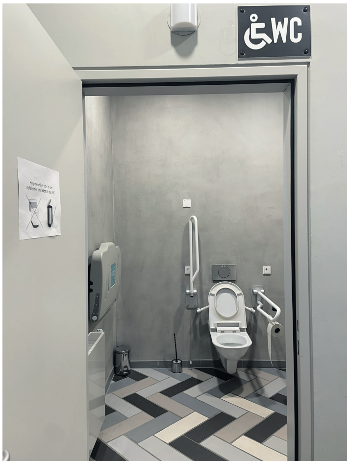
Barrier-free WC 1 st floor