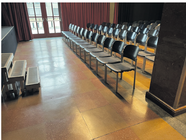
Orpheum Extra - event hall