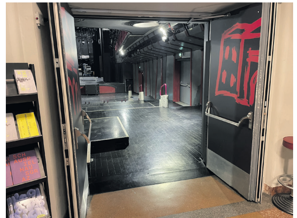
Entrance Großer Saal, barrier-free level at the back (without seating)