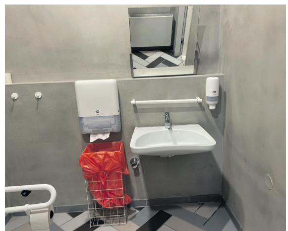
Barrier-free WC 1 st floor