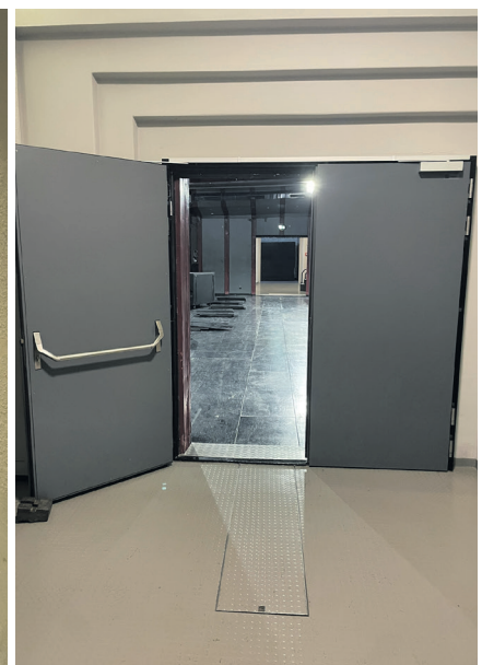
Alternative access to front seats