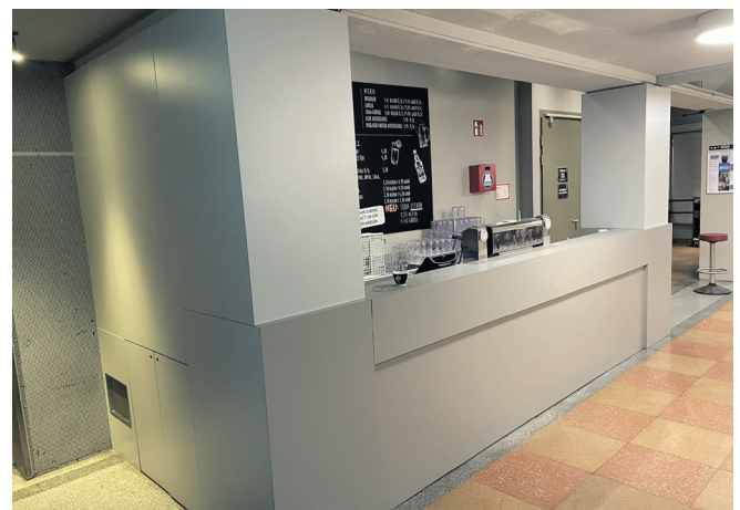
Orpheum Extra - Bar